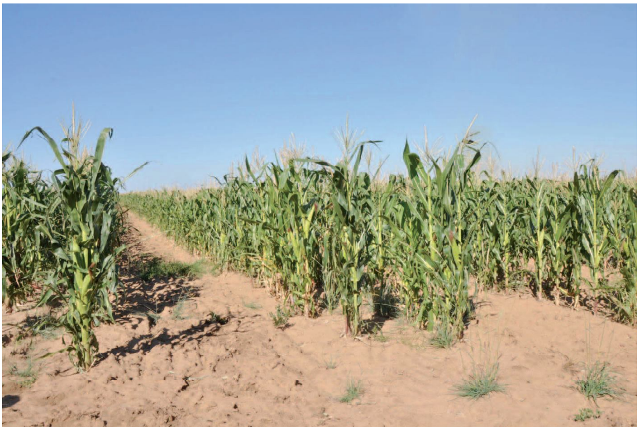
Row planted crops